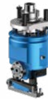
FLOATING H S Horizontal floating trimming unit