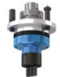
2 MULTI V3 Cabineo Vertical multi-spindle head for machining pockets for Cabineo connecting fitting