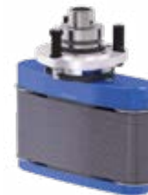
COLLEVO + Belt sanding unit for flat surfaces, exterior and inside roundings