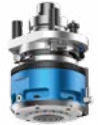
FLOATING V C Vertical floating trimming unit