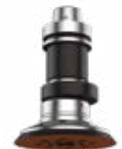
SIMOLO Orbital sanding unit for flat surfaces, convex and concave surfaces