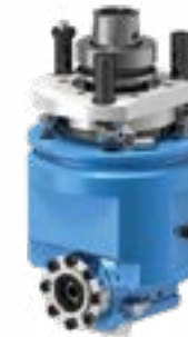
1 FLOATING H Tenso Horizontal floating trimming unit for vertical grooves for Tenso P-14 connecting fitting