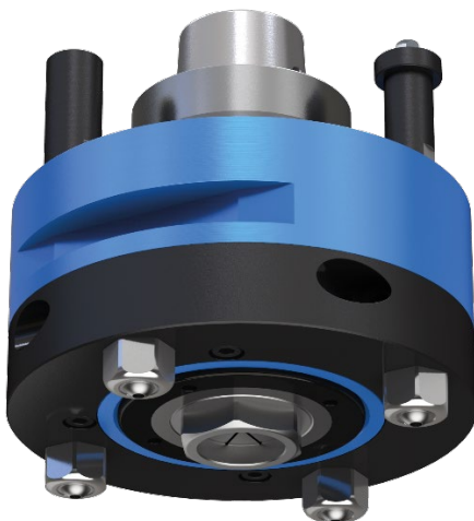
Image 2: Efficient cleaning thanks to optimized SOFFIARO blowing nozzle unit