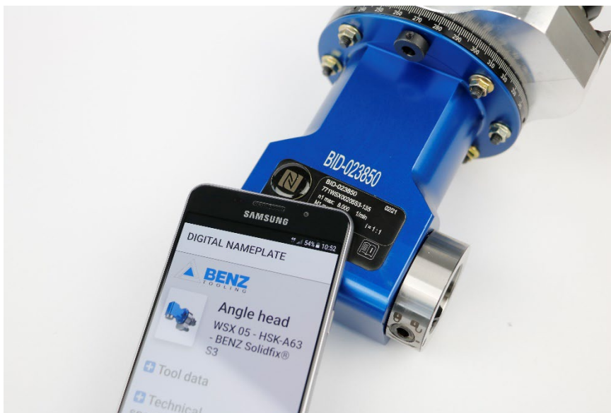
Image 4: All tool data at a glance with the BENZ i.tag digital type plate